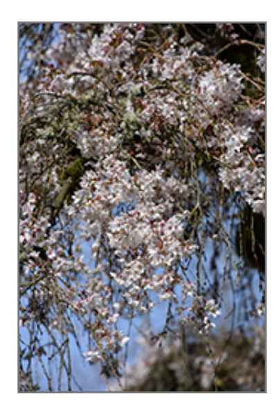
Weeping Higan Cherry flowers