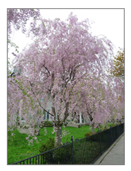
Weeping Higan Cherry in bloom

Weeping Higan Cherry is recommended for the following landscape applications;