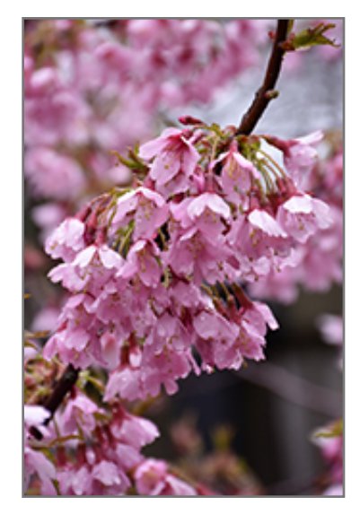
Okame Flowering Cherry flowers

Okame Flowering Cherry is a deciduous tree with an indistinguished habit of growth. Its average texture blends into the landscape, but can be balanced by one or two finer or coarser trees or shrubs for an effective composition.