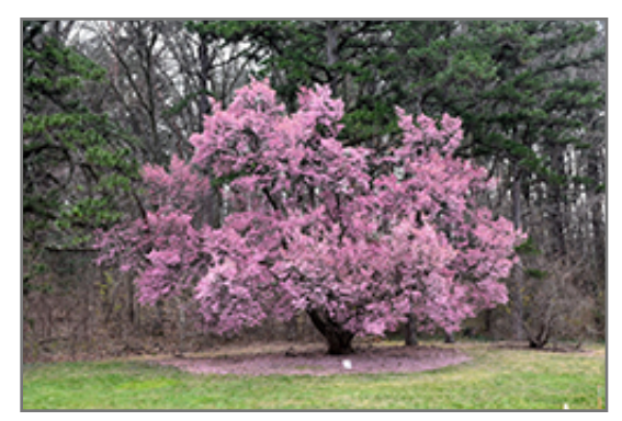
Okame Flowering Cherry in bloom

This is a relatively low maintenance tree, and is best pruned in late winter once the threat of extreme cold has passed. It is a good choice for attracting birds to your yard. It has no significant negative characteristics.