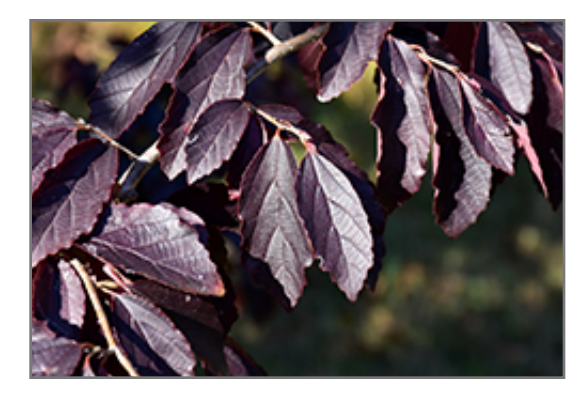
Chinese Parrotia foliage