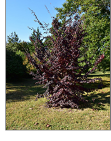
Chinese Parrotia