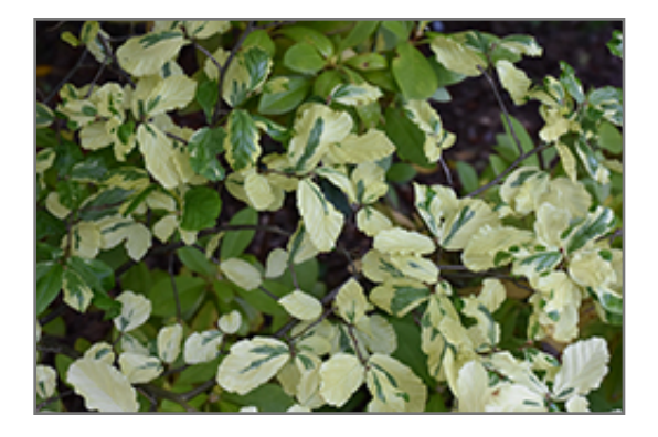
Lamplighter Parrotia foliage

Lamplighter Parrotia will grow to be about 20 feet tall at maturity, with a spread of 20 feet. It has a low canopy with a typical clearance of 2 feet from the ground, and is suitable for planting under power lines. It grows at a medium rate, and under ideal conditions can be expected to live for 80 years or more.