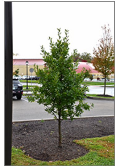
Green Gable Black Gum