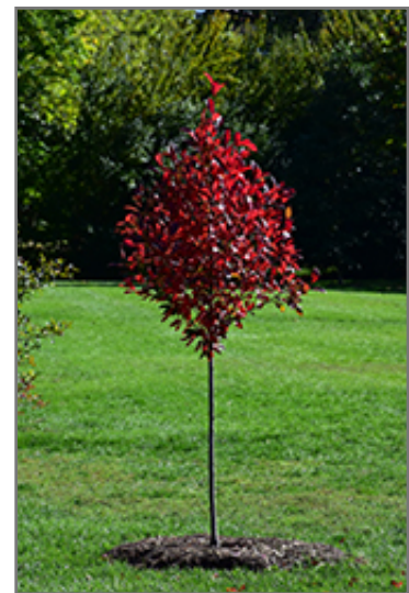
Green Gable Black Gum in fall