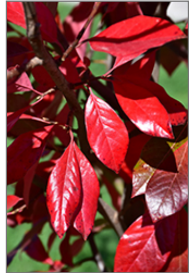
Green Gable Black Gum in fall

This tree does best in full sun to partial shade. It does best in average to evenly moist conditions, but will not tolerate standing water. It is very fussy about its soil conditions and must have rich, acidic soils to ensure success, and is subject to chlorosis (yellowing) of the foliage in alkaline soils. It is quite intolerant of urban pollution, therefore inner city or urban streetside plantings are best avoided, and will benefit from being planted in a relatively sheltered location. Consider applying a thick mulch around the root zone in winter to protect it in exposed locations or colder microclimates. This is a selection of a native North American species.