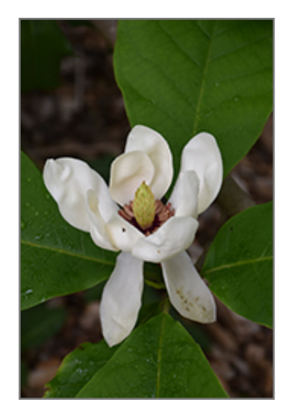
Aashild Kalleberg Magnolia flowers