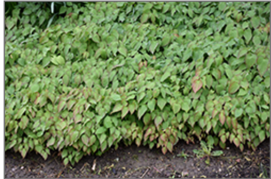
Bishop's Hat