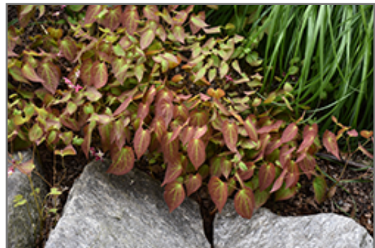
Bishop's Hat