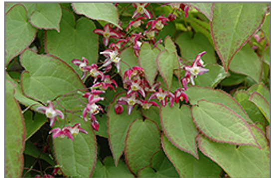
Bishop's Hat flowers

Bishop's Hat is a dense herbaceous evergreen perennial with a ground-hugging habit of growth. Its relatively fine texture sets it apart from other garden plants with less refined foliage.