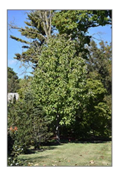
Houpu Magnolia