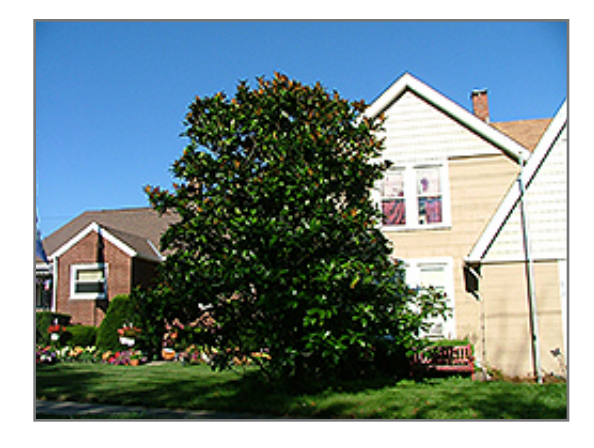
Libby Magnolia

Libby Magnolia will grow to be about 30 feet tall at maturity, with a spread of 20 feet. It has a low canopy with a typical clearance of 3 feet from the ground, and should not be planted underneath power lines. It grows at a medium rate, and under ideal conditions can be expected to live for 80 years or more.