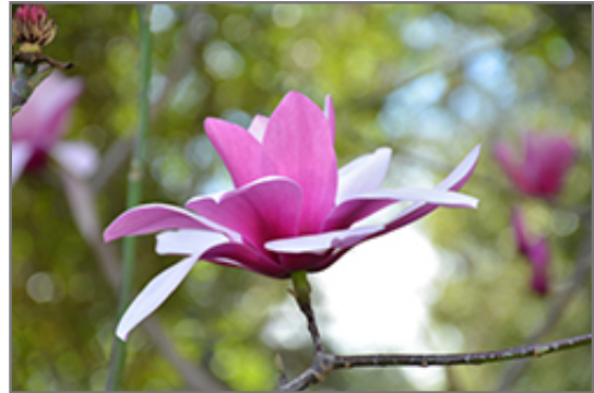
Dawson's Magnolia flowers