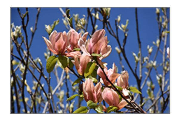
Coral Reef Magnolia flowers

Coral Reef Magnolia will grow to be about 20 feet tall at maturity, with a spread of 15 feet. It has a low canopy with a typical clearance of 2 feet from the ground, and is suitable for planting under power lines. It grows at a medium rate, and under ideal conditions can be expected to live for 50 years or more.