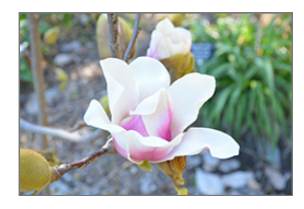
Athene Magnolia flowers