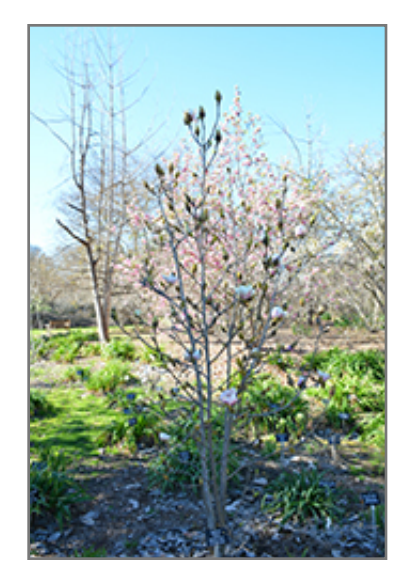
Athene Magnolia in bloom