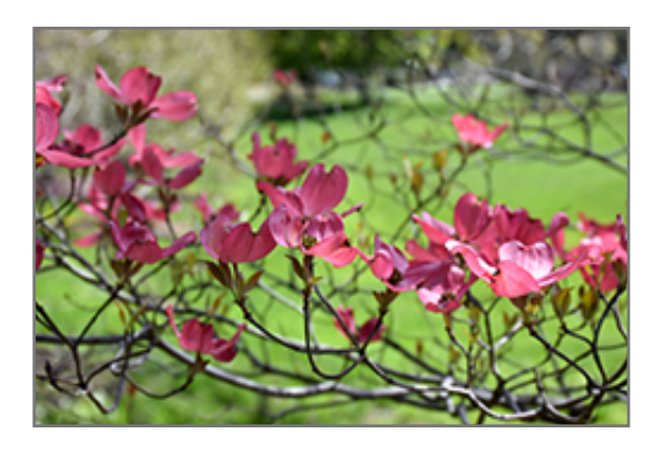
Royal Red Flowering Dogwood flowers

A highly desirable ornamental tree which is absolutely blanketed in rosy red flowers, with an attractive tiered habit as well; a pictuesque tree that requires rich, well-drained acidic soil and adequate moisture