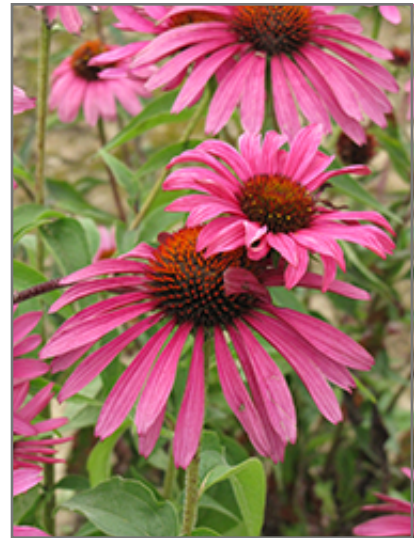
Ruby Star Coneflower flowers

Ruby Star Coneflower is recommended for the following landscape applications;