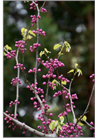
Pink Pom Poms Redbud flowers