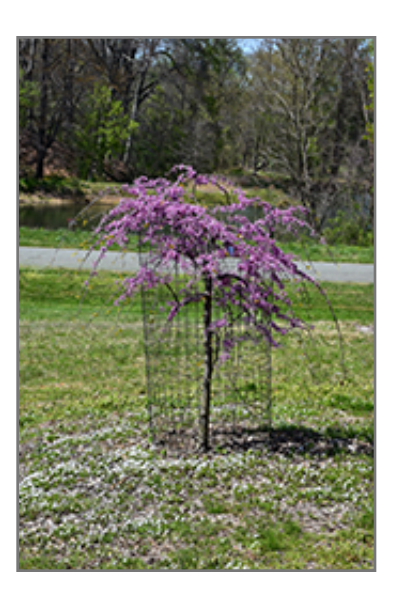
Pink Heartbreaker Redbud in bloom