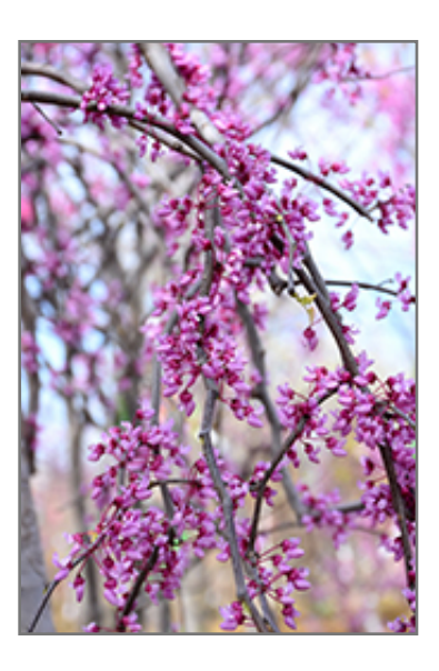
Pink Heartbreaker Redbud flowers

Pink Heartbreaker Redbud is recommended for the following landscape applications;