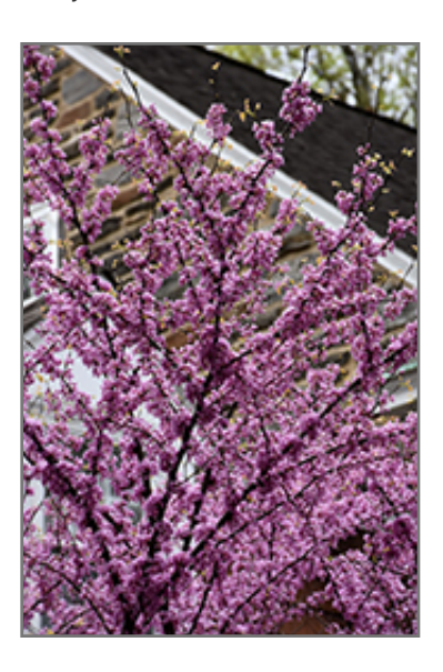
Alley Cat Redbud flowers