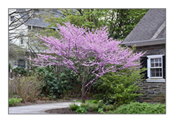
Alley Cat Redbud in bloom

Alley Cat Redbud is recommended for the following landscape applications;