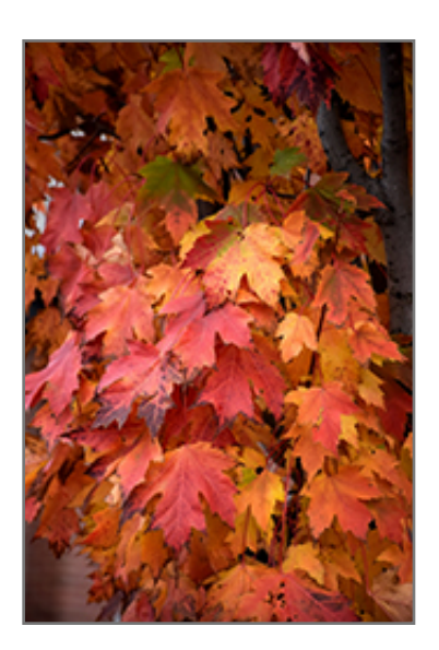
Armstrong Gold Maple in fall