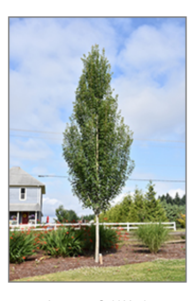
Armstrong Gold Maple