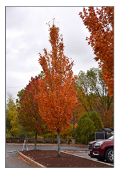
Armstrong Gold Maple in fall

This tree should only be grown in full sunlight. It is quite adaptable, prefering to grow in average to wet conditions, and will even tolerate some standing water. It is not particular as to soil type or pH. It is highly tolerant of urban pollution and will even thrive in inner city environments. This particular variety is an interspecific hybrid.