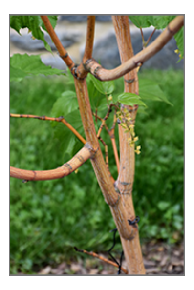
Phoenix Snakebark Maple bark