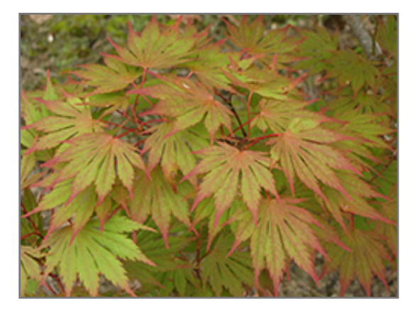
Sensu Full Moon Maple foliage

Sensu Full Moon Maple is a multi-stemmed deciduous tree with a more or less rounded form. Its relatively fine texture sets it apart from other landscape plants with less refined foliage.