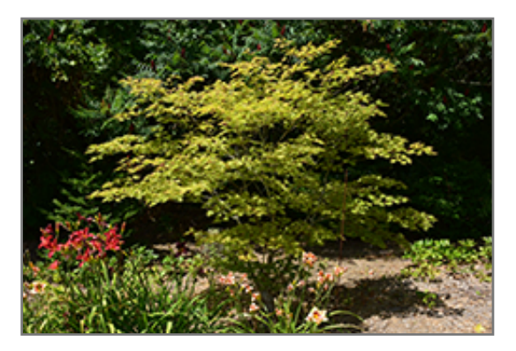
Sensu Full Moon Maple

This is a relatively low maintenance tree, and should only be pruned in summer after the leaves have fully developed, as it may 'bleed' sap if pruned in late winter or early spring. It has no significant negative characteristics.