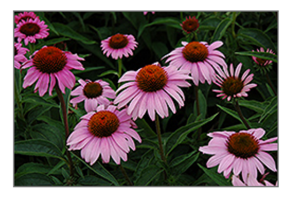
Bright Star Coneflower flowers