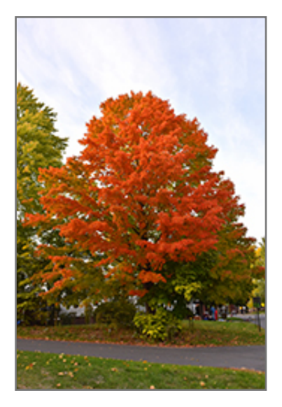
Oregon Trail Sugar Maple in fall