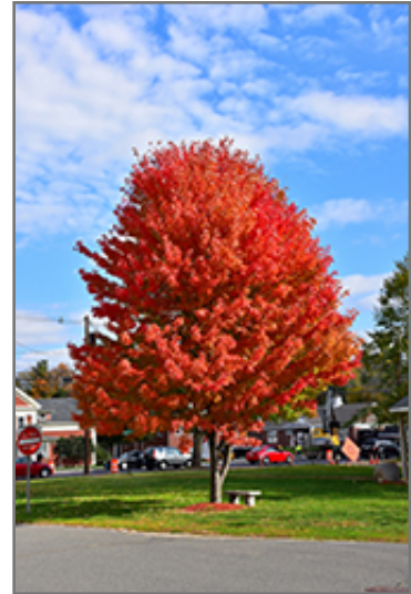
Autumn Splendor Sugar Maple in fall