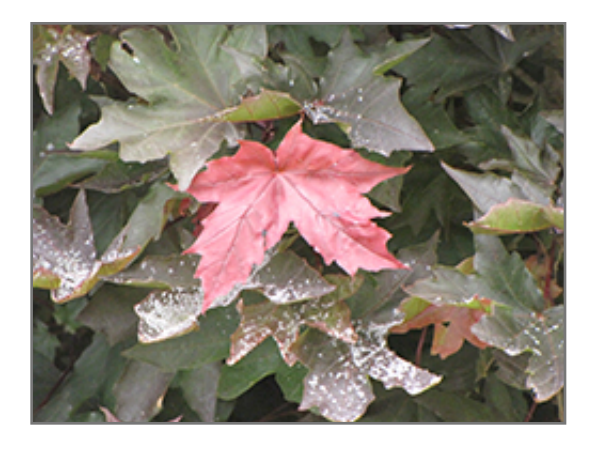
Crimson King Globe Norway Maple foliage