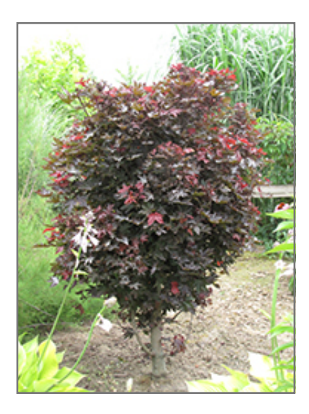
Crimson King Globe Norway Maple