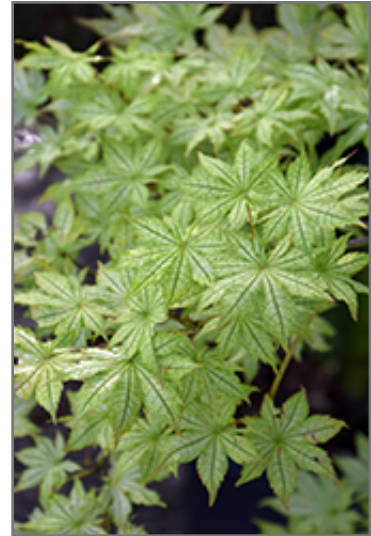
Shigitatsu Sawa Japanese Maple foliage