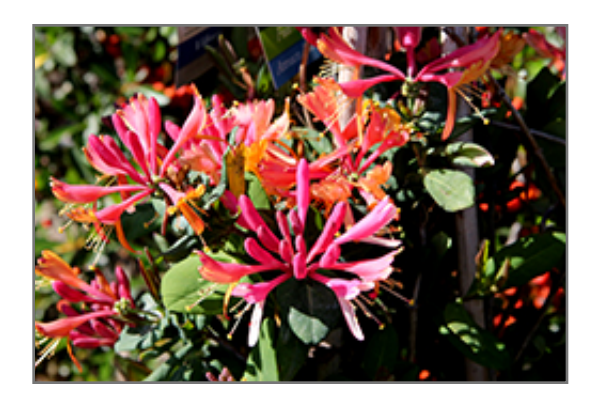
Goldflame Honeysuckle flowers

Goldflame Honeysuckle is a multi-stemmed deciduous woody vine with a twining and trailing habit of growth. Its average texture blends into the landscape, but can be balanced by one or two finer or coarser trees or shrubs for an effective composition.