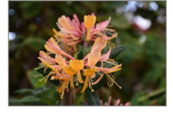
Goldflame Honeysuckle flowers