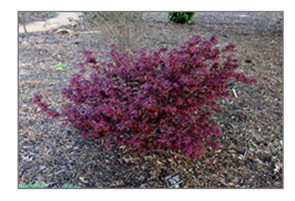
Hime Shojo Japanese Maple

This variety produces small, deeply divided leaves that emerge bright cherry-red in spring, maturing to dark maroon for most of the summer; bright red fall color; an excellent choice for container or garden use