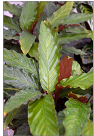
Stromanthe foliage

When grown indoors, Stromanthe can be expected to grow to be about 3 feet tall at maturity, with a spread of 3 feet. It grows at a medium rate, and under ideal conditions can be expected to live for approximately 10 years. This houseplant will do well in a location that gets either direct or indirect sunlight, although it will usually require a more brightly-lit environment than what artificial indoor lighting alone can provide. It prefers to grow in average to moist soil. The surface of the soil shouldn't be allowed to dry out completely, and so you should expect to water this plant once and possibly even twice each week. Be aware that your particular watering schedule may vary depending on its location in the room, the pot size, plant size and other conditions; if in doubt, ask one of our experts in the store for advice. It is not particular as to soil pH, but grows best in rich soil. Contact the store for specific recommendations on pre-mixed potting soil for this plant.