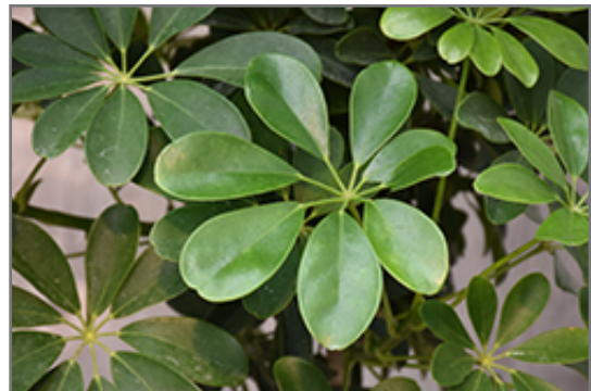
Schefflera Tree (tree form) foliage