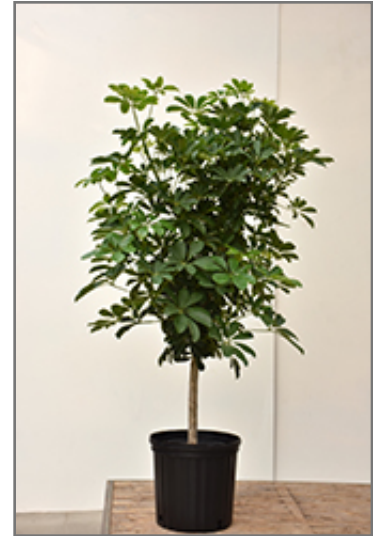
Schefflera Tree (tree form)

This is an evergreen houseplant, selected and trained to grow in a small tree-like form with the primary plant grafted high atop a standard. This plant can be pruned at any time to keep it looking its best.