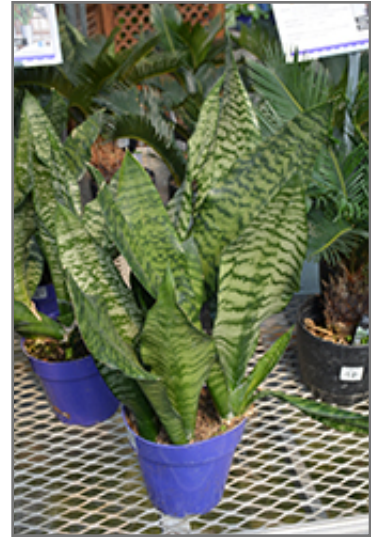
Futura Robusta Snake Plant

When grown indoors, Futura Robusta Snake Plant can be expected to grow to be about 24 inches tall at maturity, with a spread of 12 inches. It grows at a slow rate, and under ideal conditions can be expected to live for approximately 10 years. This houseplant performs well in both bright or indirect sunlight and strong artificial light, and can therefore be situated in almost any well-lit room or location. It is very adaptable to both dry and moist soil, and should do just fine under average home conditions. The surface of the soil shouldn't be allowed to dry out completely, and so you should expect to water this plant once and possibly even twice each week. Be aware that your particular watering schedule may vary depending on its location in the room, the pot size, plant size and other conditions; if in doubt, ask one of our experts in the store for advice. It is not particular as to soil pH, but grows best in sandy soil. Contact the store for specific recommendations on pre-mixed potting soil for this plant.