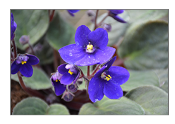
Hybrid Blue African Violet flowers

True blue flowers with yellow centers rise above glossy dark green leaves on this lovely plant; an excellent tabletop accent; easy to care for