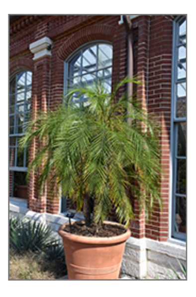
Pygmy Date Palm

This is a multi-stemmed houseplant with a towering form with a high canopy of foliage concentrated at the top of the plant. Its relatively fine texture sets it apart from other indoor plants with less refined foliage. This plant should not require much pruning, except when necessary to keep it looking its best.