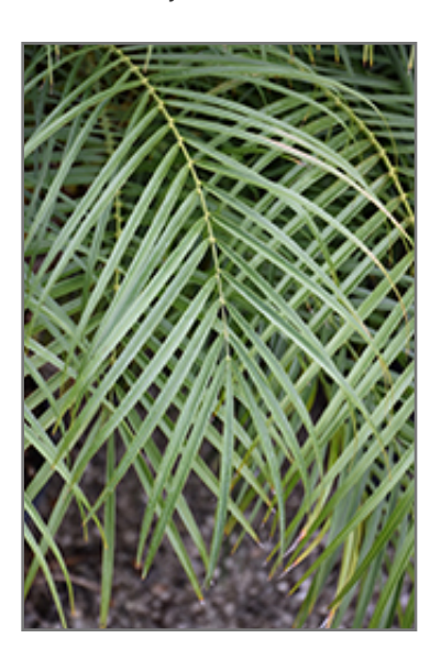
Pygmy Date Palm foliage