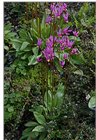
Shooting Star in bloom