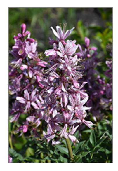
Pink Gas Plant flowers

Pink Gas Plant is recommended for the following landscape applications;