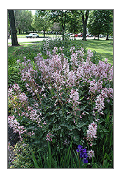
Pink Gas Plant in bloom