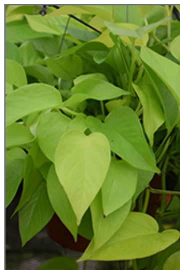
Neon Pothos foliage