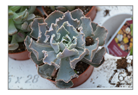
Blue Curls Echeveria

When grown indoors, Blue Curls Echeveria can be expected to grow to be about 10 inches tall at maturity, with a spread of 12 inches. It grows at a medium rate, and under ideal conditions can be expected to live for approximately 20 years. This houseplant will do well in a location that gets either direct or indirect sunlight, although it will usually require a more brightly-lit environment than what artificial indoor lighting alone can provide. It prefers dry to average moisture levels with very well-drained soil, and may die if left in standing water for any length of time. This plant should be watered when the surface of the soil gets dry, and will need watering approximately once each week. Be aware that your particular watering schedule may vary depending on its location in the room, the pot size, plant size and other conditions; if in doubt, ask one of our experts in the store for advice. It is not particular as to soil pH, but grows best in sandy soil. Contact the store for specific recommendations on pre-mixed potting soil for this plant.