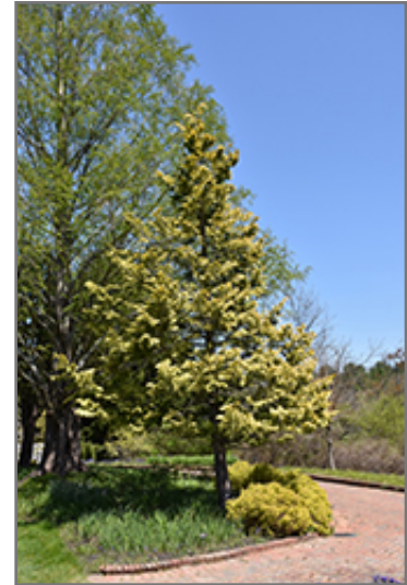
Cripps Gold Falsecypress

This tree does best in full sun to partial shade. It prefers to grow in average to moist conditions, and shouldn't be allowed to dry out. It is not particular as to soil type or pH. It is highly tolerant of urban pollution and will even thrive in inner city environments, and will benefit from being planted in a relatively sheltered location. Consider applying a thick mulch around the root zone in winter to protect it in exposed locations or colder microclimates. This is a selected variety of a species not originally from North America.