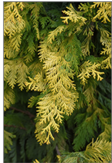
Cripps Gold Falsecypress foliage