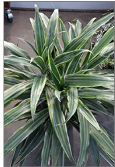
Warneckii Dracaena foliage

This is an herbaceous evergreen houseplant with an upright spreading habit of growth. Its relatively coarse texture stands it apart from other indoor plants with finer foliage. This plant may benefit from an occasional pruning to look its best.