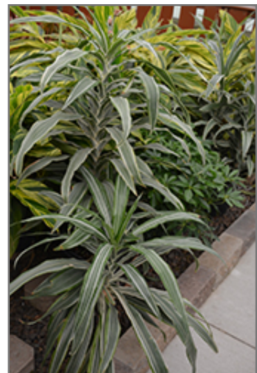
Warneckii Dracaena