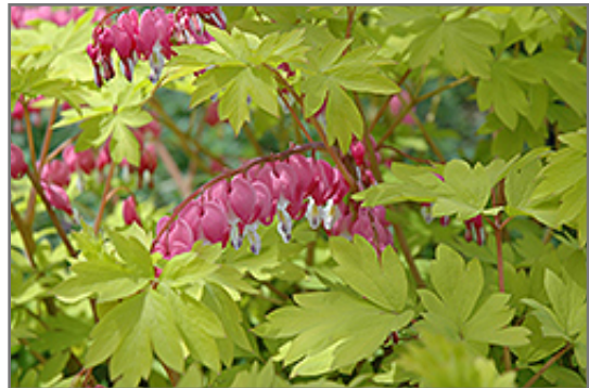
Gold Heart Bleeding Heart flowers