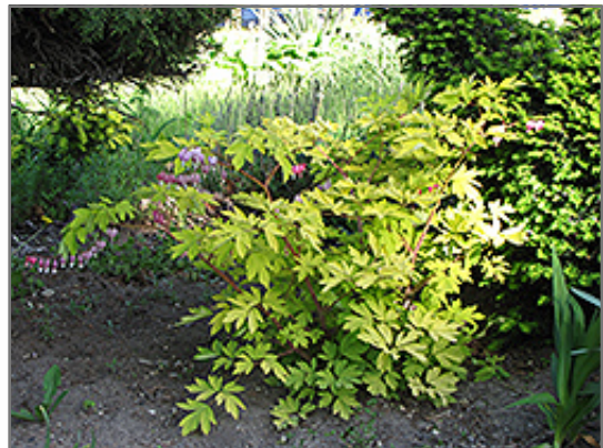
Gold Heart Bleeding Heart in bloom Photo courtesy of NetPS Plant Finder