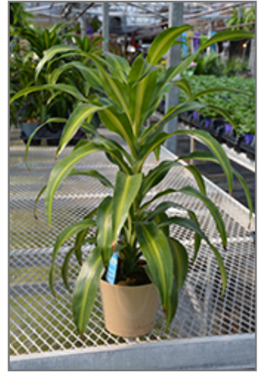
Hawaiian Sunshine Dracaena

When grown indoors, Hawaiian Sunshine Dracaena can be expected to grow to be about 5 feet tall at maturity, with a spread of 30 inches. It grows at a medium rate, and under ideal conditions can be expected to live for approximately 10 years. This houseplant performs well in both bright or indirect sunlight and strong artificial light, and can therefore be situated in almost any well-lit room or location. It does best in average to evenly moist soil, but will not tolerate standing water. The surface of the soil shouldn't be allowed to dry out completely, and so you should expect to water this plant once and possibly even twice each week. Be aware that your particular watering schedule may vary depending on its location in the room, the pot size, plant size and other conditions; if in doubt, ask one of our experts in the store for advice. It is not particular as to soil type or pH; an average potting soil should work just fine.