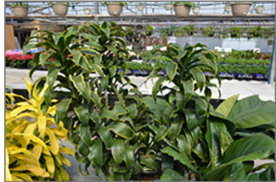
Dorado Dracaena

When grown indoors, Dorado Dracaena can be expected to grow to be about 4 feet tall at maturity, with a spread of 24 inches. It grows at a medium rate, and under ideal conditions can be expected to live for approximately 10 years. This houseplant performs well in both bright or indirect sunlight and strong artificial light, and can therefore be situated in almost any well-lit room or location. It does best in average to evenly moist soil, but will not tolerate standing water. The surface of the soil shouldn't be allowed to dry out completely, and so you should expect to water this plant once and possibly even twice each week. Be aware that your particular watering schedule may vary depending on its location in the room, the pot size, plant size and other conditions; if in doubt, ask one of our experts in the store for advice. It is not particular as to soil type or pH; an average potting soil should work just fine.