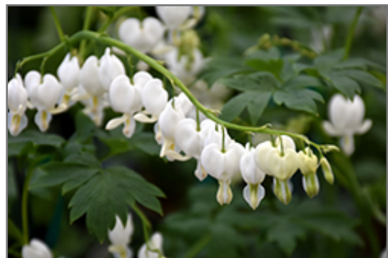
White Bleeding Heart flowers