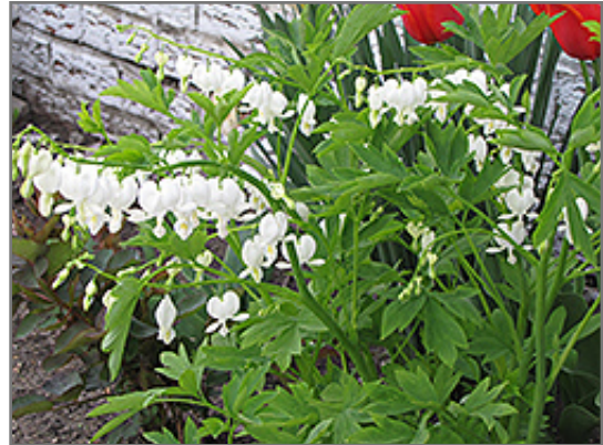
White Bleeding Heart in bloom

This plant does best in partial shade to shade. It prefers to grow in average to moist conditions, and shouldn't be allowed to dry out. It is not particular as to soil pH, but grows best in rich soils. It is somewhat tolerant of urban pollution. Consider applying a thick mulch around the root zone over the growing season to conserve soil moisture. This is a selected variety of a species not originally from North America. It can be propagated by division; however, as a cultivated variety, be aware that it may be subject to certain restrictions or prohibitions on propagation.