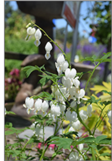
White Bleeding Heart flowers