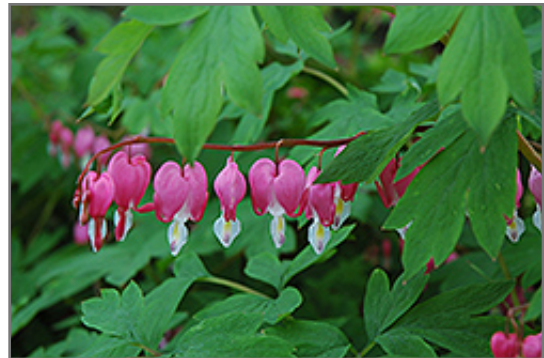
Common Bleeding Heart flowers