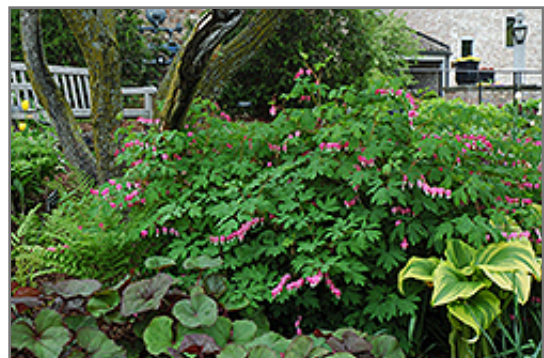
Common Bleeding Heart in bloom