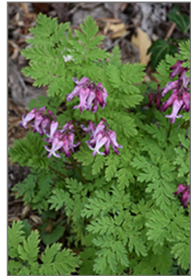
Bleeding Heart flowers

Easy to grow, compact bushy mound of deeply cut, fern-like blue-green foliage featuring long stems of rosy-pink, dangling heart shaped flowers; an excellent addition to borders, rock gardens or garden beds; blooms from mid spring to the middle of summer