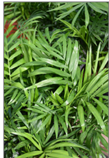
Neanthe Bella Palm foliage