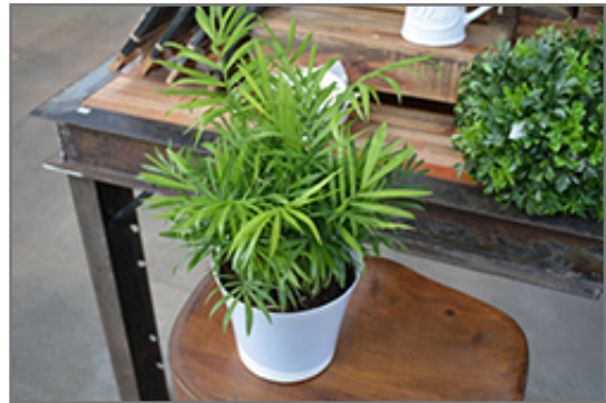
Neanthe Bella Palm

This is an open multi-stemmed evergreen houseplant with a shapely form and gracefully arching foliage. Its relatively fine texture sets it apart from other indoor plants with less refined foliage. This plant should not require much pruning, except when necessary to keep it looking its best.