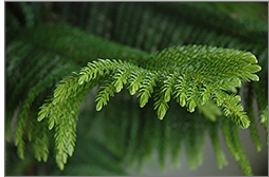
Norfolk Island Pine foliage

This is a dense multi-stemmed evergreen houseplant with a distinctive and refined pyramidal form. Its extremely fine and delicate texture is quite ornamental and should be used to full effect. This plant usually looks its best without pruning, although it will tolerate pruning.