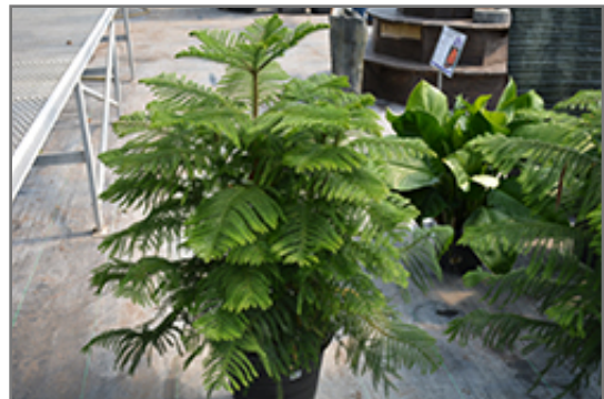
Norfolk Island Pine