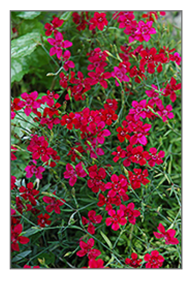
Flashing Light Maiden Pinks flowers

Vigorous and free flowering, this selection features lovely frilly crimson blooms with deep red center rings, spreading across a low growing mat of green foliage; drought tolerant and easy to grow, ideal for rock gardens, borders or used as groundcover