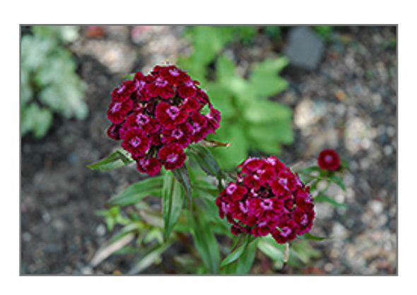
Sweet William flowers

Tall stems with densely packed crimson colored, frilly flowers with white eyes rise above narrow green foliage during the late spring and into the fall; excellent addition to cottage gardens, beds, borders or containers