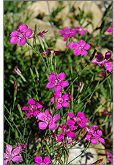
Alpine Pinks flowers