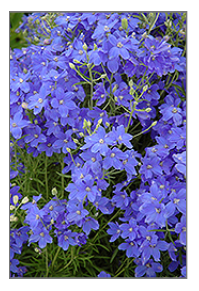
Blue Elf Delphinium flowers

A wonderful compact, bushy variety that features stunning blue flowers that rise above grey green, ferny foliage; a lovely heat tolerant addition to borders, beds and containers; beautiful cut flower; remove spent flowers to encourage new growth